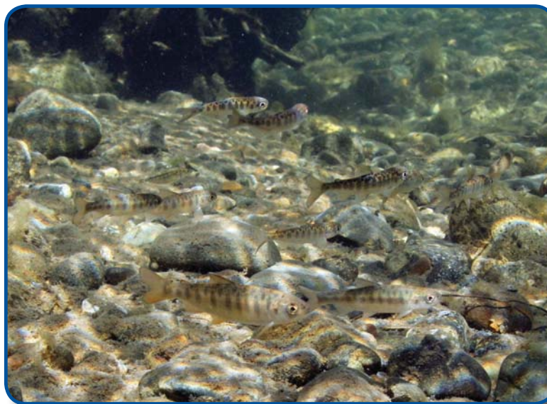
August 2012: Juvenile Chinook using created habitat near Indian Creek in the mainstem Trinity River. The large tree root in the background provides places for the young fish to easily hide from predators.

River restoration efforts designed to increase fish populations can be measured. However, salmon lifecycles can extend up to five years. Several generations of fish still need to be counted to measure the true influence of restoration actions. The river continues to flow, contour and re-design itself, creating new habitat and erasing old. Collection, analysis, and review of data will continue to influence future restoration projects and, ultimately, the health of the Trinity River fisheries.