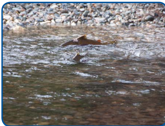
November 2012: Coho spawning in a tributary of the Trinity River. This creek has benefited from years of conservation work to reduce in-stream sediment.