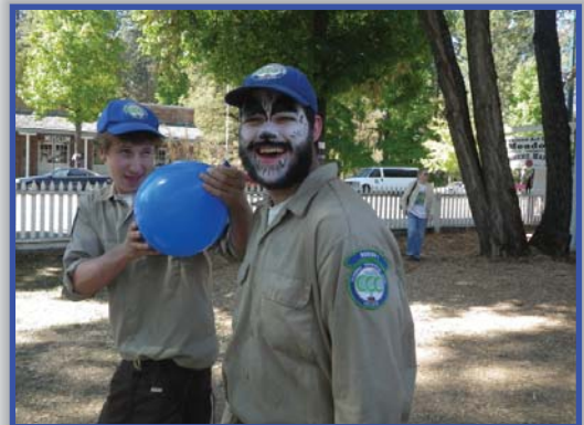
The 2012 Salmon Festival was sponsored by the Trinity River Restoration Program and the Trinity County Chamber of Commerce