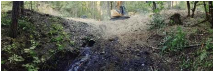
Road being removed, but culvert still intact.