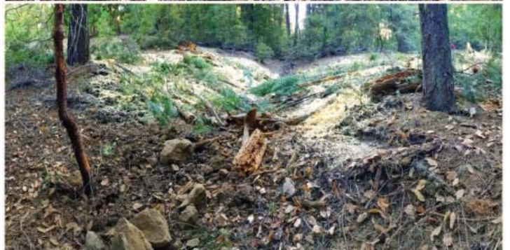
Each set of photos (above and below) show before and after images of decommissioned roads.