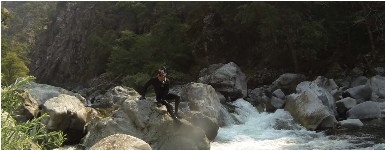
Participant navigating a survey reach on the New River.

years, told the assembled crews “the most dangerous thing you’re going to do today is walk.” As hip, knee, rib, and elbow bruises attest, the most hazardous part of the job can be walking in shallow water over slick river rock.