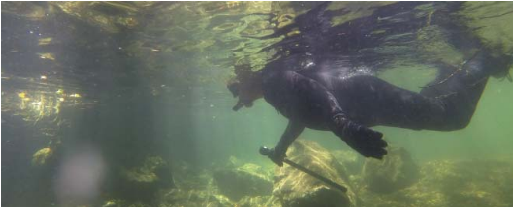
Survey participant snorkeling the South Fork Trinity River.

salmon ( Oncorhynchus tshawytscha ) and adult summer steelhead ( O. mykiss ). In addition to their ecological importance in the watersheds, early migrating salmon populations help sustain the recreational fishing industry and are essential to indigenous cultures in the region.