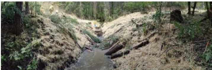
Road is removed, land is re-contoured, and stream is free-flowing again.