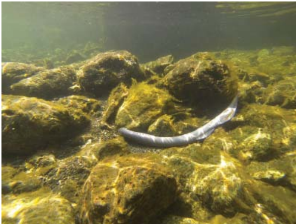
Dead lamprey on the South Fork Trinity River 8/16/2017.

Fortunately, as the largest undammed Wild and Scenic River in California, the South Fork Trinity River holds potential to rebound and support healthy runs of spring-run Chinook salmon. And much like the New River, the South Fork watershed is largely within public lands. Along with the dozens of summer adults in the Salmon River, the wild spring-run Chinook salmon in the South Fork Trinity and New Rivers are some of the last remaining populations in the Klamath River watershed.