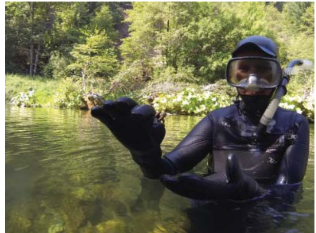
A foothill yellow-legged frog found during the snorkel survey.

Previously, it was thought that fall-run Chinook and winter steelhead could evolve to take the place of spring-run fish if they go extinct. However, early migrators may have increasing