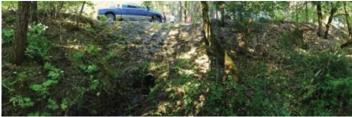
Note truck on road before decommissioning and culvert pipe below it.

Several roads were also decommissioned this summer: two in the Trinity/Lewiston Lake area and one near Stuarts Gap in the East Fork of the South Fork Trinity River. The roads were identified by the USFS through environmental assessment as roads to be removed from their system of roads; two of the three were impassable to vehicles due to brush or other reasons. After decommissioning, all disturbed areas were seeded and mulched; trees and riparian plants will be planted this fall or next spring to encourage stream channel recovery. This project will eliminate road failure risk and was funded by the CA OHV Commission and the Trinity County USFS RAC.